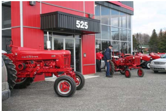
Figure 6. J.M. Chagnon inc. Coaticook, November 2, 2006. Two vintage tractors: Farmall 300 and Farmall Cub.

Rheault brothers own four other Case-IH dealerships (Nicolet, Berthierville, St. Maurice, and Lac St. Jean).