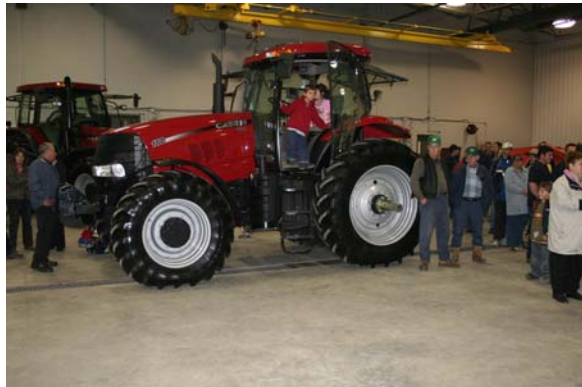
Figure 7. J.M. Chagnon inc. Coaticook, November 2, 2006. Presentation of new Puma series.

The business that Raymond and his father built continues. On Thursday, November 2, 2006, the new, modern, and more spacious garage opened on the west side of the town. The building covers 23000 square feet on a five-acre site. It includes a large showroom for equipment, a large parts department, and 12 worksites in the garage. There are three salesmen. Raymond still works part time as a sales representative.