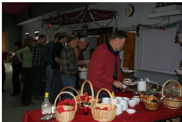
Figure 1. Members and their guests line up for Christmas brunch. Salle Guy Veilleux, Cookshire QC. December 3, 2006.