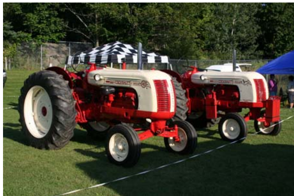
Figure 7. Expo 2010, Compton QC, August 21. Two nice Cockshutts (40, Golden Eagle D4). Owner : Jack McAuley.