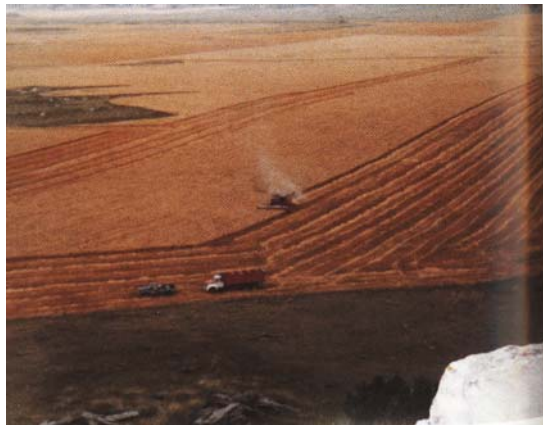
Figure 10. Aerial view of wheat harvest in Colorado 1983. From the book 'Starks Harvesters', Robert White

The film related their experiences on the road, in the field, and their lifestyle. They often worked 18 to 20 hours a day, almost without stopping, except for maybe fifteen minutes to eat a sandwich or hamburger.