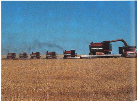
Cutting south of Kremlin, Montana, August 1979.