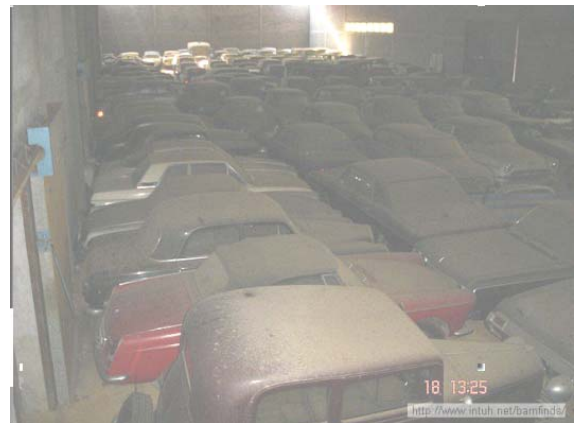
Figure 5. What an American found inside a Portugal barn that he inherited.

The Powerpoint involved slides of a barn in Portugal that an American had inherited. The barn had been locked and the doors welded shut for years. When they opened the doors, they found a huge collection of classical cars, mostly European, Fiats, Bugattis, Porches, Lotus, Aston Martins, a real treasure.