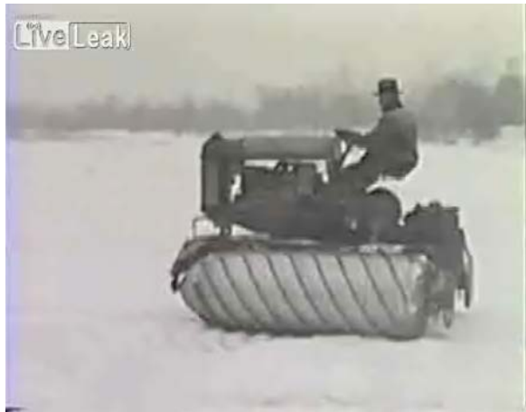
Figure 3. Picture from the video showing a Fordson tractor equipped with pontoon screws.

1920's video of a Fordson tractor equipped with pontoon type screws, which permitted the tractor exceptional flotation and maneuverability on deep snow. The video showed the tractor pulling two sleighs heavily loaded with logs. A Chevrolet car also converted to pontoons was also featured. The tractor and car could travel across snow some four feet deep with ease. This can be seen at http://www.liveleak.com/view?i=568_1233111054