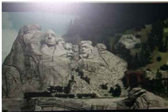
Figure 4. A small part of the Miniatur Wunderland display in Hamburg Germany.

The second video featured Miniatur Wunderland in Hamburg Germany. This is a huge model railway display. One train is 14 m long. The trains travel through towns like Hamburg with scale models of the famous buildings, through a miniature recreation of the Alps, the Grand Canyon, and many other famous places. There is a miniature airport, a seaport, ships plying the waters, streets with moving cars, and many other features. A battery of computers controls the whole display. This is a very impressive and