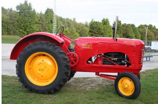
Figure 4. Expo 08 Compton. Yvon Cloutier's Massey Harris 102.

Tuesday morning, Gordon had ordered a 50-pound box of these potatoes from the Boni-Choix store in Compton. They arrived Wednesday morning.