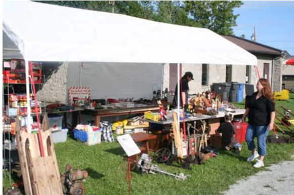
Figure 3. Expo 08 Compton. Flea market Kaylon Sarrasin and Sylvia Young.

There were five vendors who participated in the flea market. They had a vast selection of articles for sale, such as old reel lawnmowers, radios, tools, medallions, pins from towns and other groups, and a lot of articles. The vendors were located close to the entrance in front of the skate park and near the service building on each side of the roadway. The flea market, organized by Dave Sarrasin, added an interesting feature to the machine show.